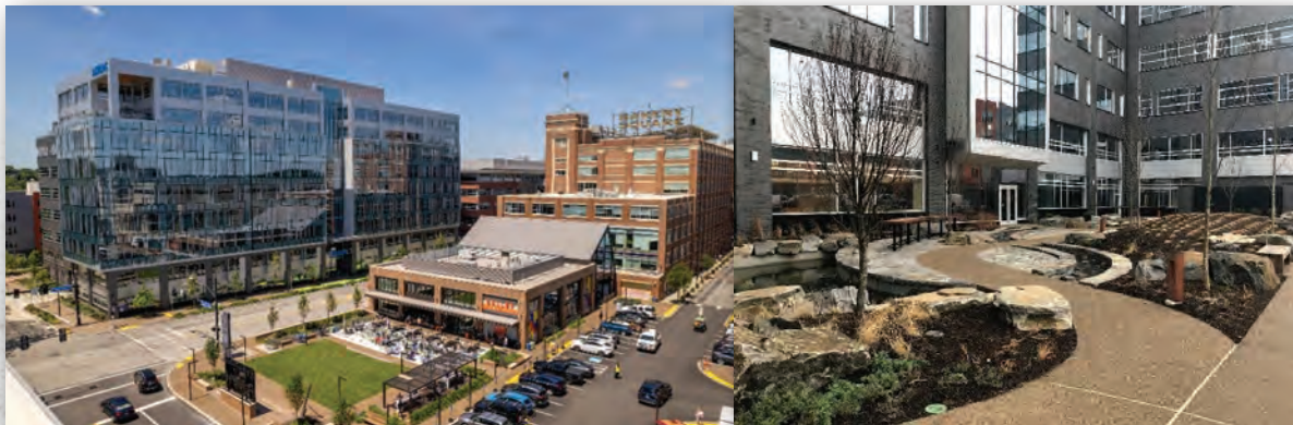
Photos from the 7th Annual Excellence in Concrete Project Award Winner PJ Dick for the Bakery Square Sitework project.