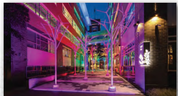
Photo from the 7th Annual Excellence in Concrete Project Award Winner PJ Dick for the Bakery Square Sitework project.